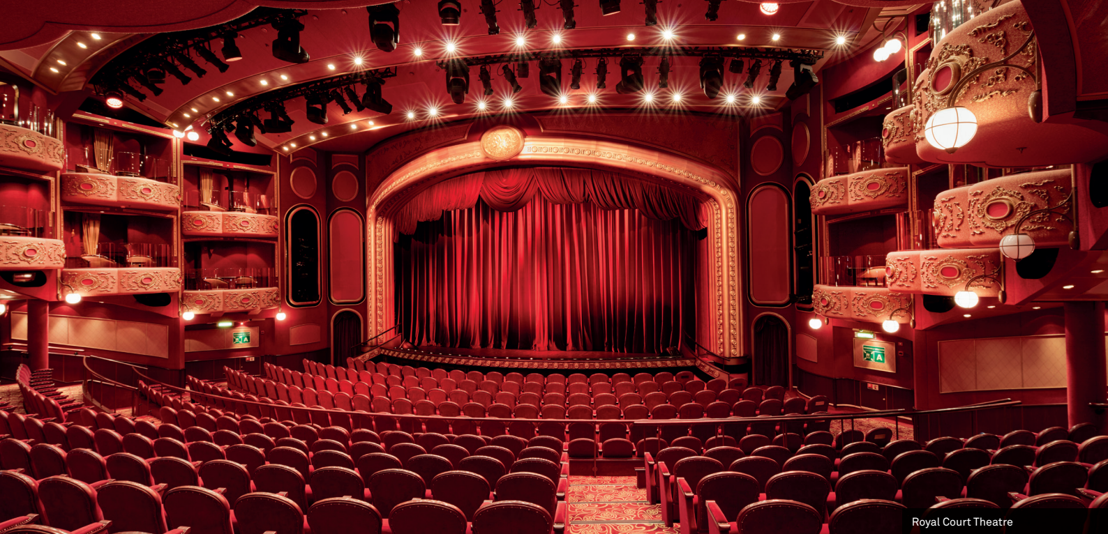
Royal Court Theatre